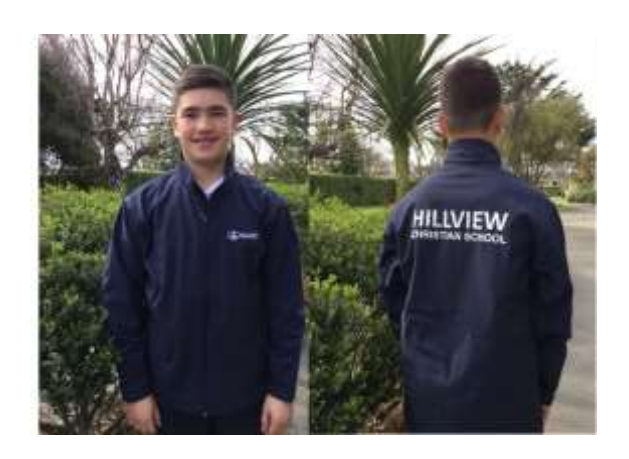
Please name ALL items clearly with first and last name