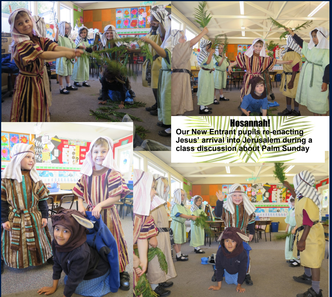
Hosannah! Our New Entrant pupils re-enacting Jesus' arrival into Jerusalem during a class discussion about Palm Sunday

Our Mission: To provide a quality education in a Christian environment where children can develop their God-given abilities.