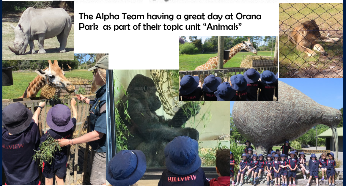
The Alpha Team having a great day at Orana Park as part of their topic unit "Animals"

Junior Campus: 150 Wilsons Rd Senior Campus: 125 Wilsons Rd