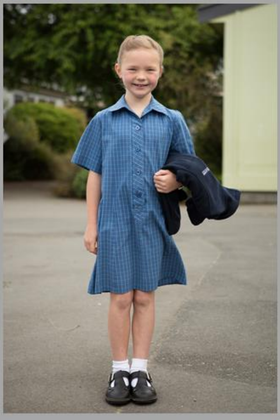
Summer - Years 0-6 Girls