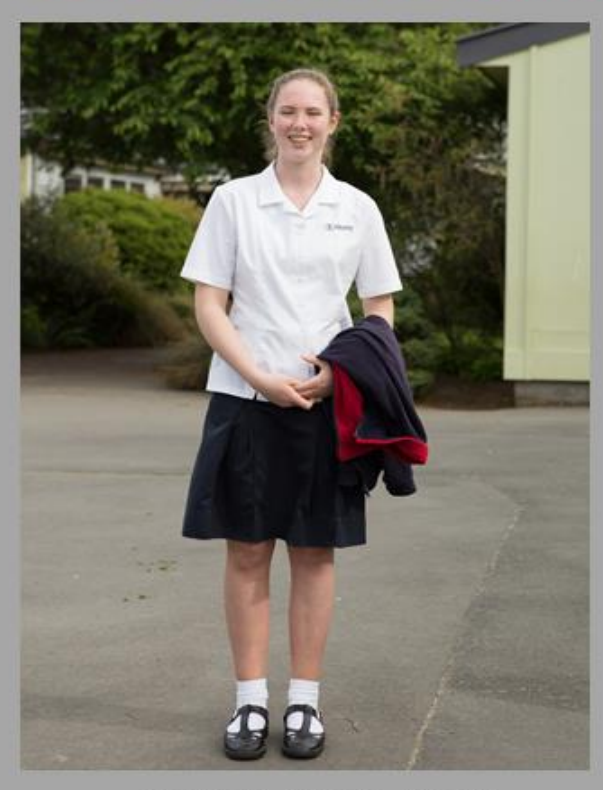
Summer - Year 7 - 10 girls (white ankle, not sports socks)