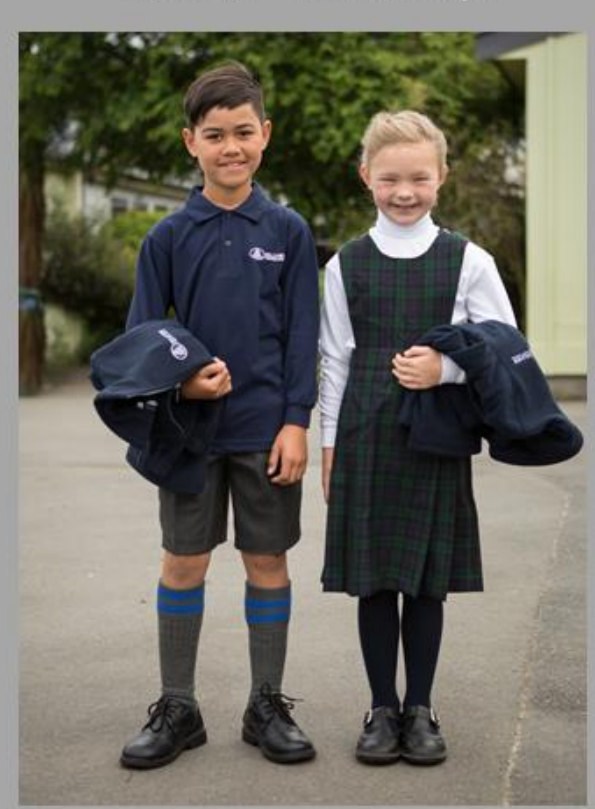
Winter – Year 0-6 Boys & Girls