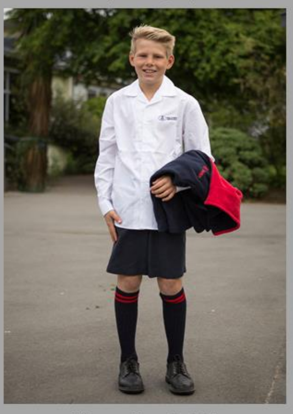
Winter - Year 7 - 10 boys (navy sock with red stripe)

Shoes: Please refer to uniform guidelines for correct footwear