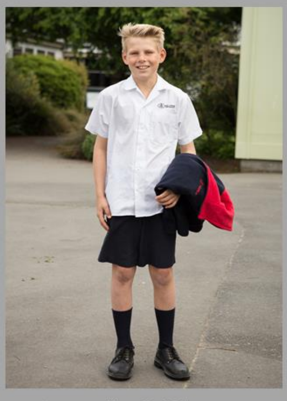
Summer - Year 7 - 10 boys (navy dress, ankle socks)