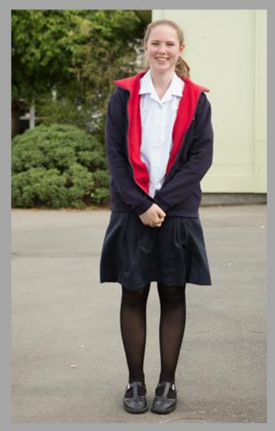
Winter - Year 7 - 10 girls (black tights)