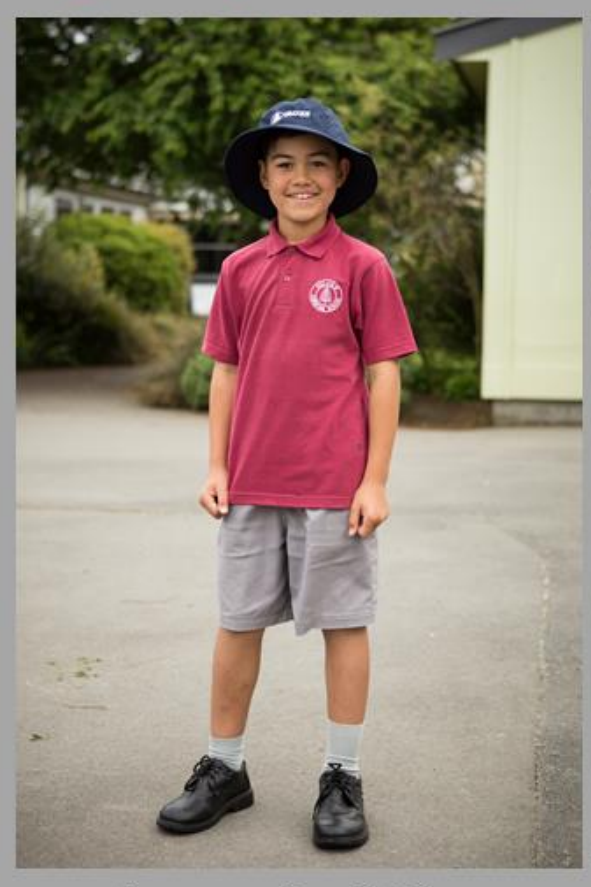
Summer – Year 0-6 Boys