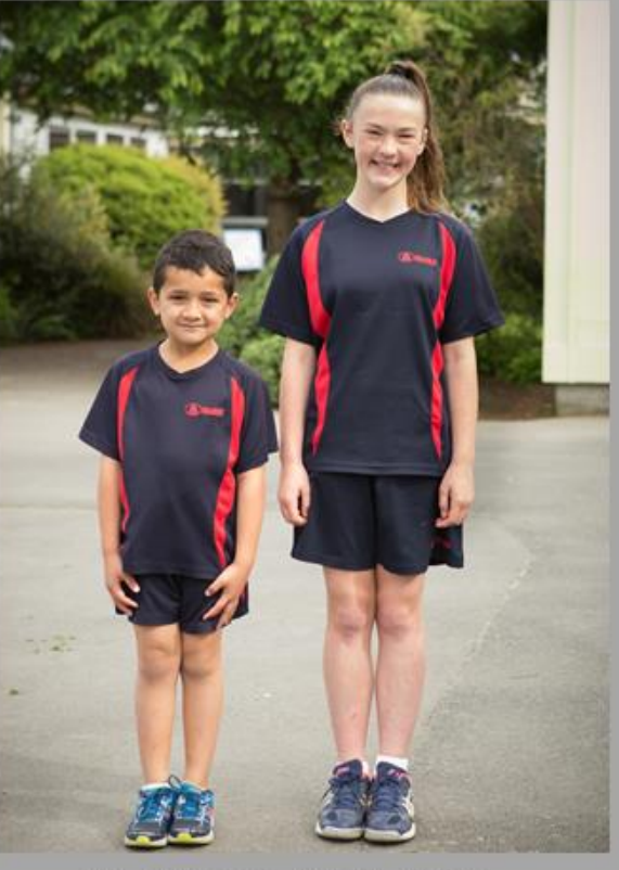
PF Uniform - Years -0-10

Shoes: Please refer to uniform guidelines for correct footwear